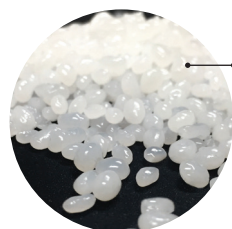
PELLETS Ideal for auto-fed hot melt dispensing equipment

AJ hot melt adhesives are available in two forms.