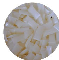
PILLOWS* Ideal for manual handling and scooping into hot melt dispensing equipment, proven to increase melt rate